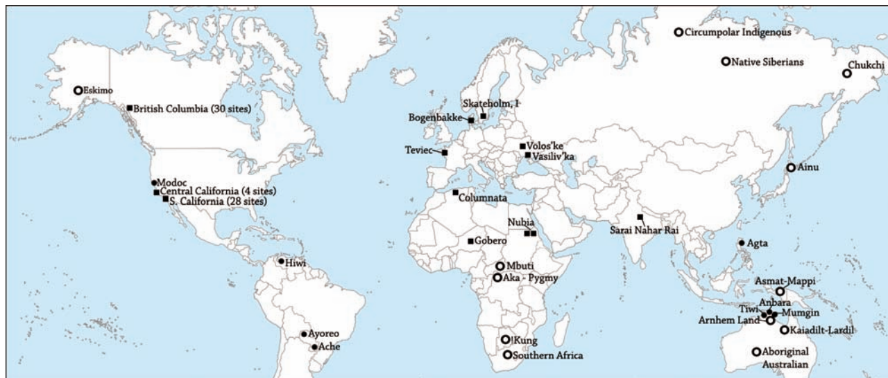
Fig. 1. Sources of archaeological (filled squares) and ethnographic (filled dots) evidence on warfare and genetic (open dots) data on between-group differences.

The two key determinants of the effect of warfare on the evolution of social behaviors are the extent of genetic differences between the winners and losers of conflicts and the effect of the number of altruists in a group on group members’ average fitness. Warfare affects the second by making the presence of altruists in a group critical to the members’ survival (and hence their fitness). There are two ways in which the outcome of a conflict may affect the average fitness of its members. The first is that members of losing groups are more likely to perish, and those who die may either produce no offspring or leave children who